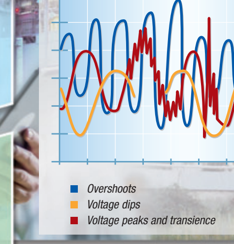
Fig. 1: Possible Irregularities