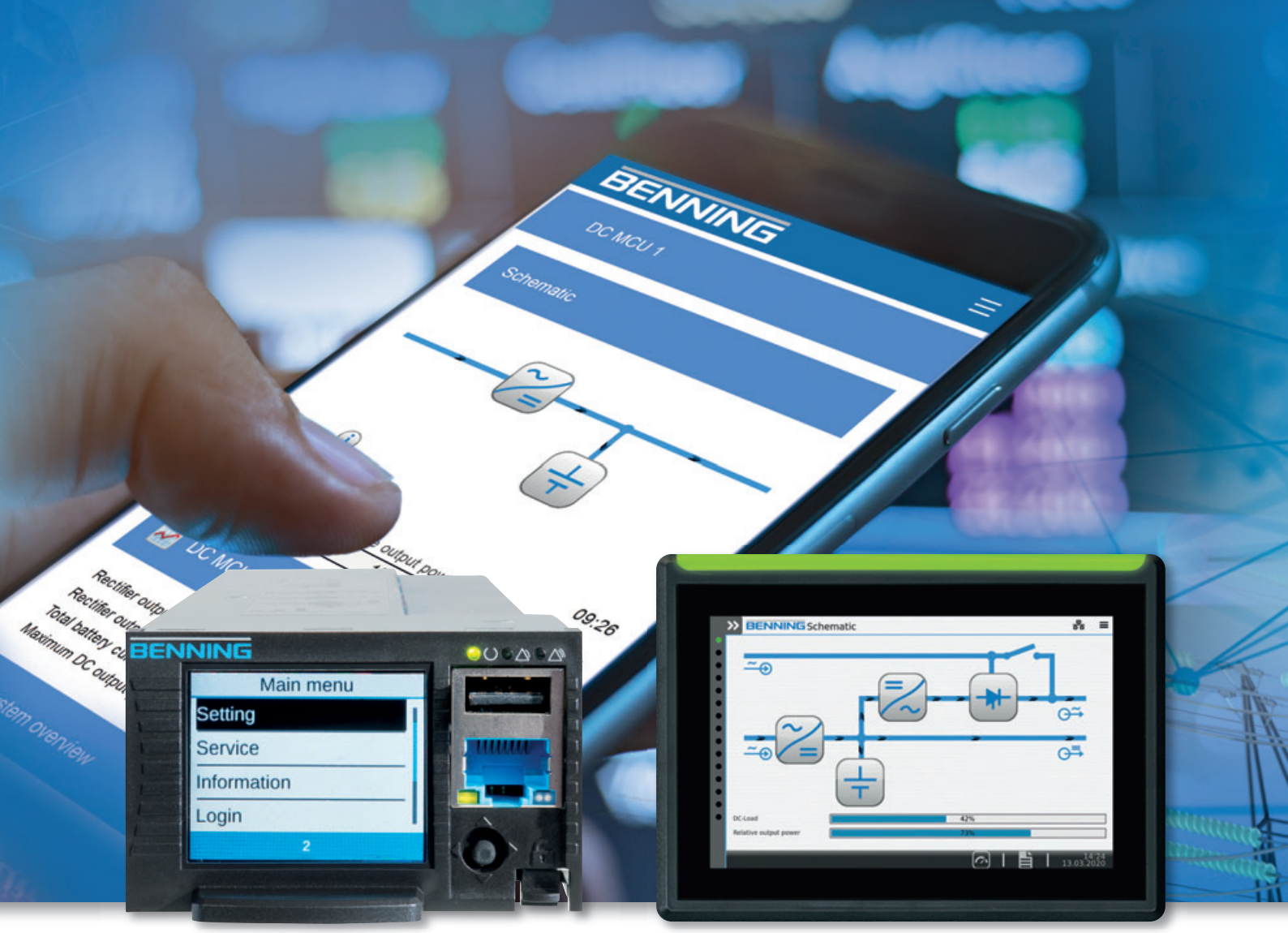
Fig. 8: The front of the new SLIMLINE controller module has a 1.8" display, a USB 2.0 port (to accommodate a WLAN stick, for instance), as well as an Ethernet port