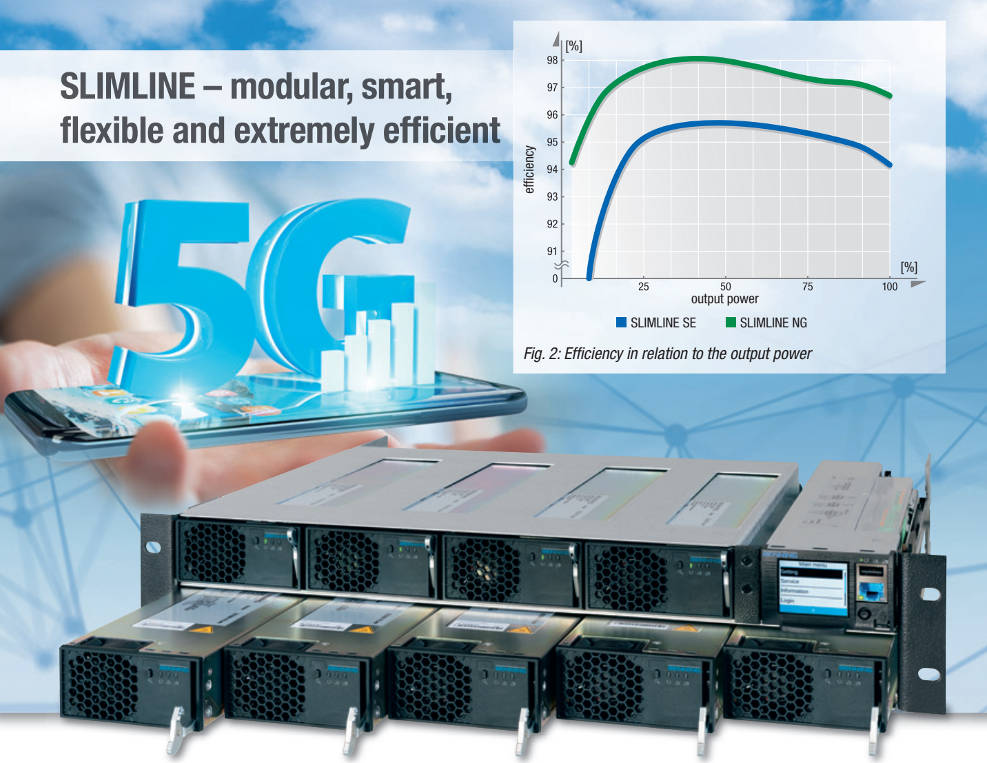
Fig. 3: The 19" 1H carrier can accommodate either four 48 V and 3 000 W rectifier modules combined with a controller or five rectifier modules.