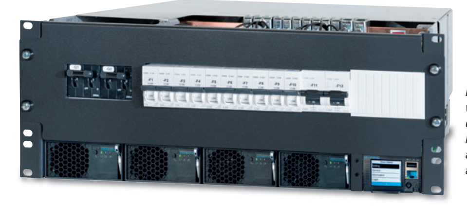
Fig. 6: SLIMLINE system 48 V / 12 kW with a controller, as well as battery and consumer distribution.

Power ratings of 3 - 27 kW can be achieved by scaling the rectifiers and adapting the distribution.