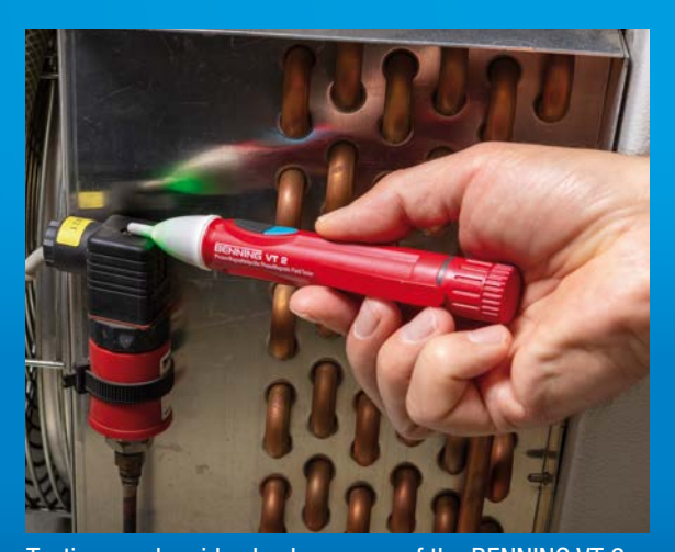
Testing a solenoid valve by means of the BENNING VT 2