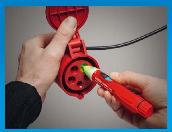
Phase sequence testing in CEE coupling with TRITEST® easy