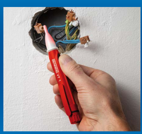
Phase test in junction boxes with BENNING VT 1