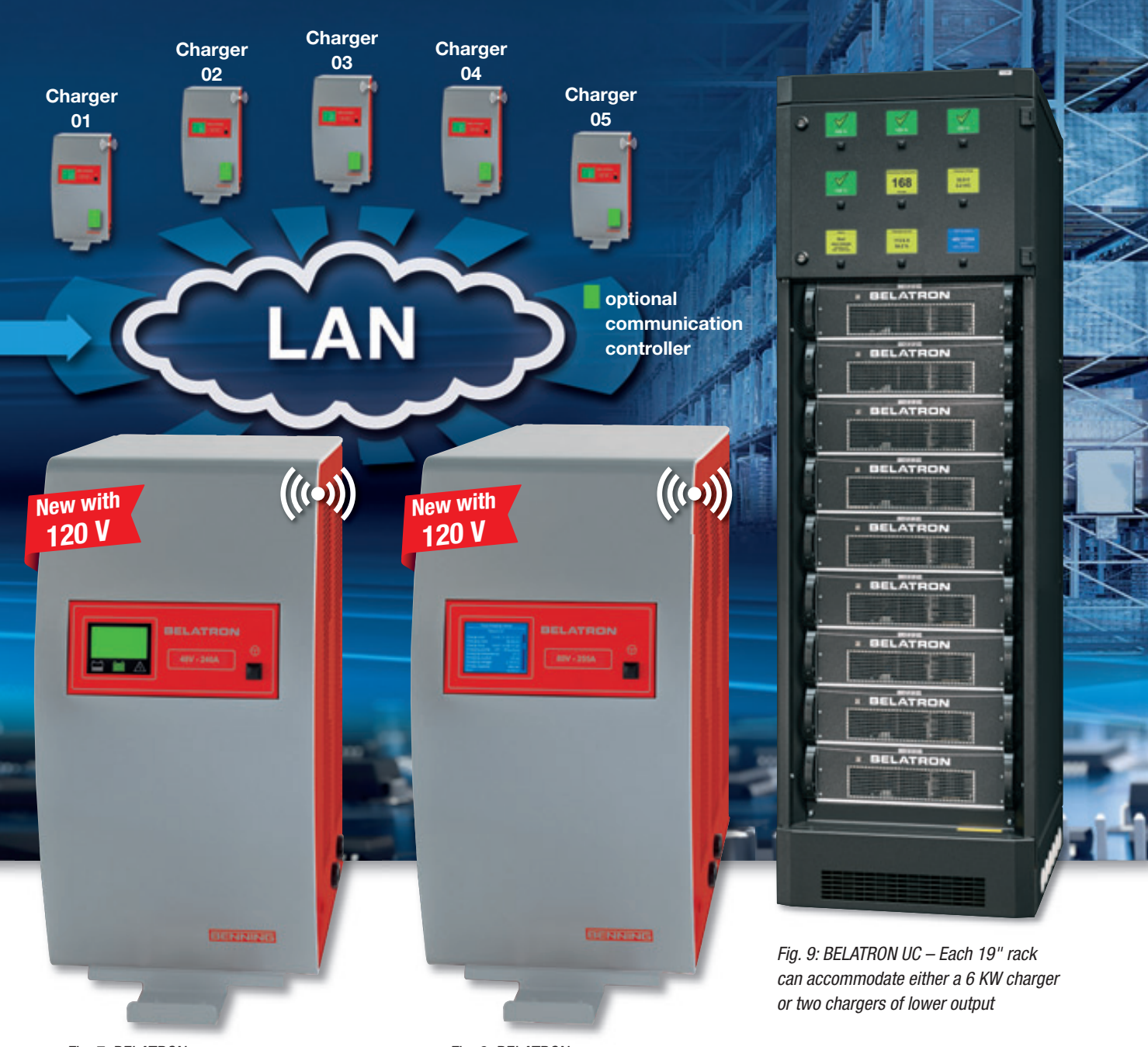
Fig. 7: BELATRON 48 V - 240 A, Casing WT120