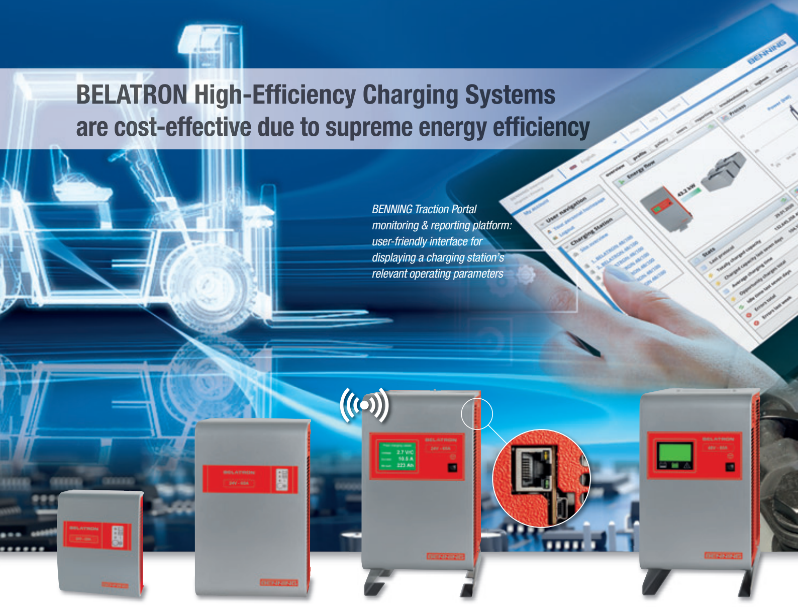
Fig. 1: BELATRON 24 V - 30 A, Casing WT7