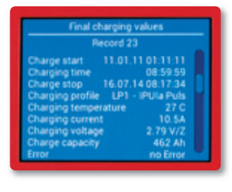
The 3.5" touch-screen enables not only settings but also parameters to be adapted. Furthermore, apparatus and battery information can be interrogated.