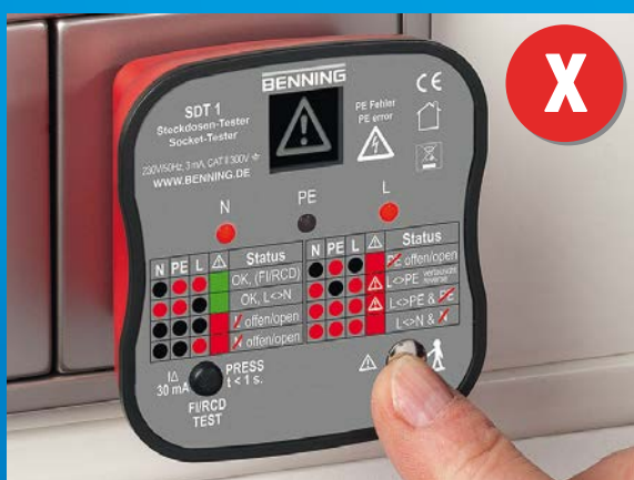
Socket with wiring error, danger to life! External conductor (L) and protective conductor (PE) have been inverted!