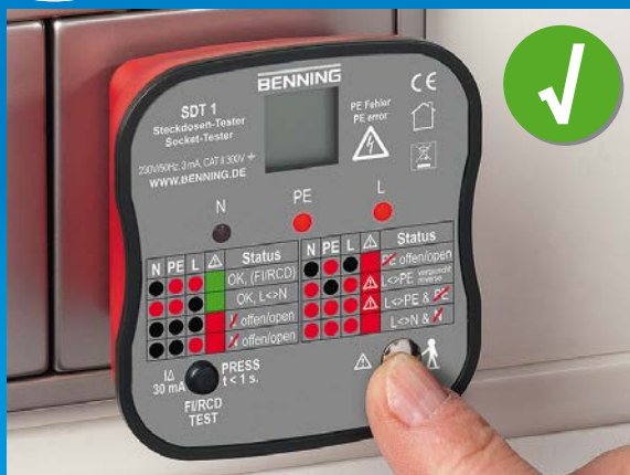
Socket is installed correctly, contact sensor checks the PE contact for dangerous contact voltage