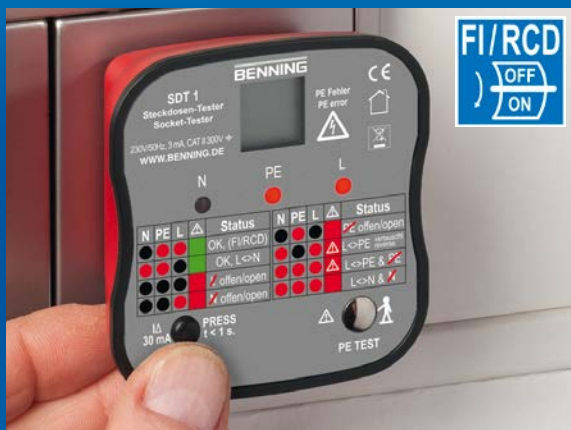
Testing the tripping function of a 30 mA RCD by pressing the FI/RCD TEST key